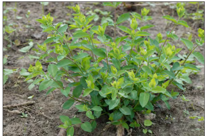
Honeysuckle sprouts as a result of cutting off the shrub at the ground. A follow-up foliar herbicide application can now be applied.

or overspray. In addition, care needs to be taken to ensure that herbicides are sprayed to wet the foliage but not to the point of runoff.