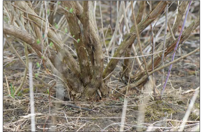
A basal application of herbicide needs to be made to the lower 12–18 inches of the honeysuckles’ stems.

Herbicides (both water- and oil-soluble) recommended for cut stump treatments of bush honeysuckle are listed in Table 2. Late summer, early fall, or dormant season applications have all proven to be effective. Avoid applications during sap-flow (spring) as this lessens the effectiveness of the herbicide application.