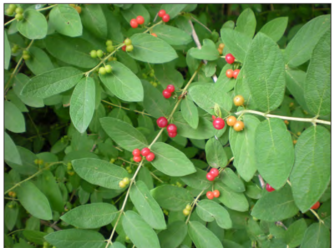
Honeysuckle fruit.