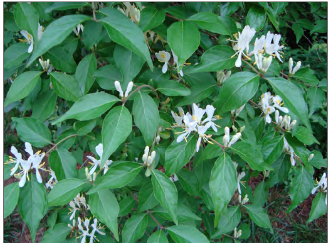
Amur honeysuckle.