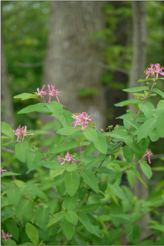
Tartarian honeysuckle.